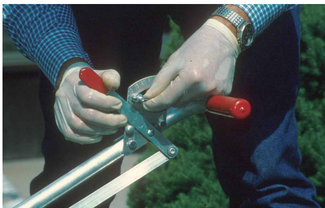
Figure 5. Granular applicator settings are often listed on product labels for correct delivery rates.