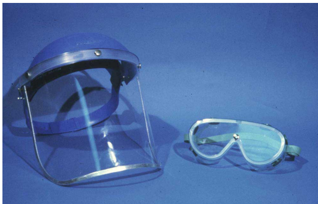
Figure 6. A full face shield or goggles are suitable for working with pesticides.

disposable suits are available, such as Tyvek™ materials. Some products may also specify eye protection, especially during mixing concentrated pesticides. If this is required, face shields, protective goggles, and safety glasses are all options (Figure 6).