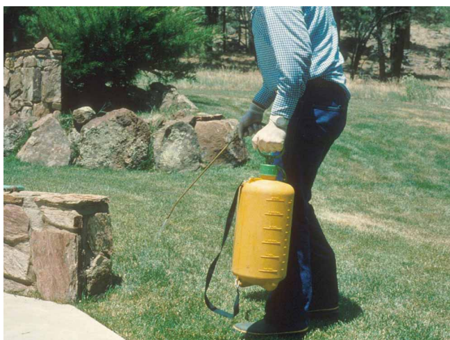
Figure 4. A hand-pump sprayer is commonly used to deliver pesticide diluted in water around lawn and garden.

Many of the product labels for granular products include a table with a listing of settings that are specific for popular granular lawn spreaders (Figure 5).