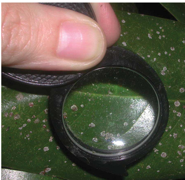
Figure 2. Accurate pest identification is critical in determining the right pesticide to use.

If a pesticide is necessary, how do you choose the right one when there are thousands of products available on the market? The correct pesticide to use can only be determined if you have correctly identified the pest(s). Pest identification is the critical step in determining the right pesticide to use (Figure 2).